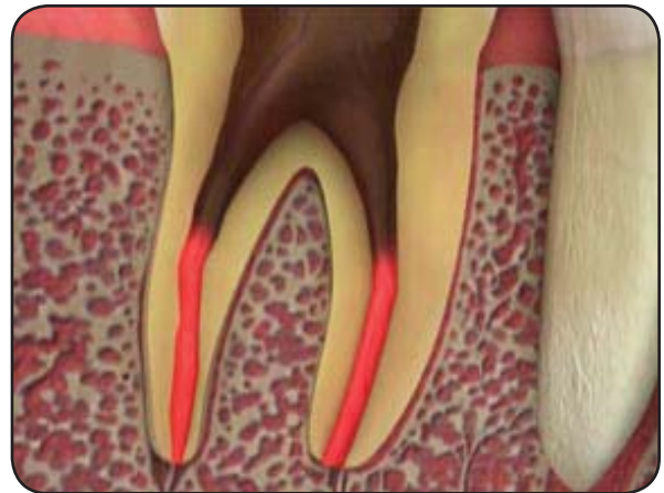
Infection spreading into root canals