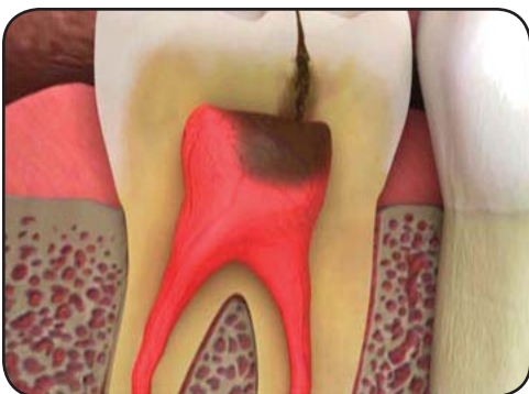
Infection spreading from cracked tooth to pulp chamber